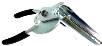
Hog Ring Tool

Don't waste time struggling with single hog rings. Use the Hog Ring Fencing Pliers available at L&C Enterprises-USA, Inc.