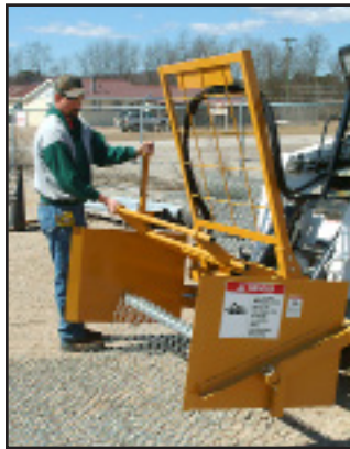
Safe to Operate

The Rapid Roller handles 5 foot to 8 foot fabric and with the longer adjusting arm will roll fabric up to 12 feet high. Simply cut the fabric from the posts, hook it to the Rapid Roller and wind up the fabric. No rolling by hand or uneven rolls. You can roll up to 100 feet of fabric in just a few minutes. If the fabric is short, hog ring the next fabric to the roll and continue rolling. The Rapid Roller easily attaches to a skid-steer. You can roll fabric in difficult areas, even high grass. Shake leaves and debris free by raising the fabric in the air. Designed by fencers who know the business, you will wonder why you ever rolled fabric by hand before.